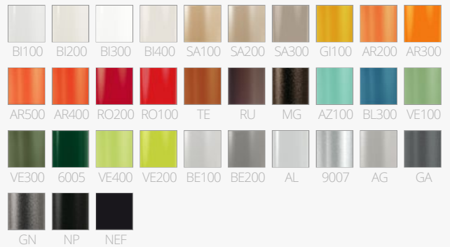
TABLE BASES FINISHES